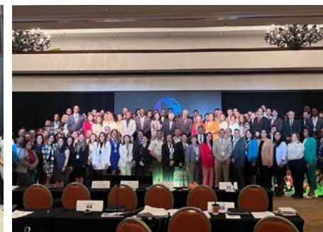
Latin American & the Caribbean Regional Conference on Autonomous Weapons 2023, Costa Rica