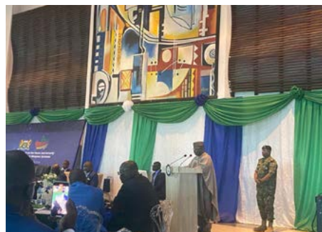
ECOWAS Freetown Conference on Autonomous Weapons 2024, Sierra Leone