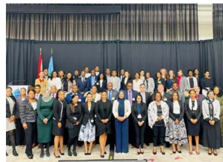
Caribbean Community (CARICOM) Conference 2023, Port of Spain, Trinidad and Tobago