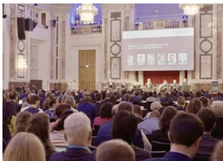
Vienna Conference on Autonomous Weapons Systems 2024, Austria