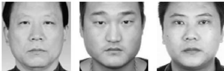
(a) Three samples in criminal ID photo set S_c .