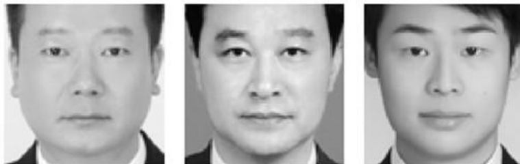
(b) Three samples in non-criminal ID photo set S_n